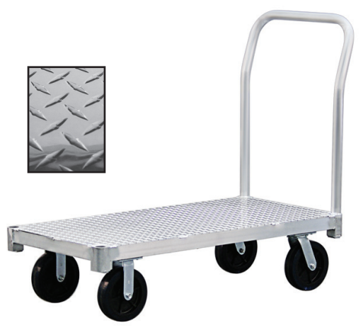
Tread Plate Deck (shown with caster upgrade)