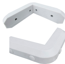
CBM-20 Corner Bumpers (per set)