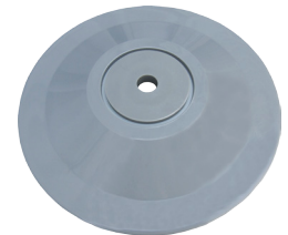
RB-10 Revolving Bumpers (per set)