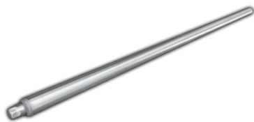
PT Post Only w/ Caps & Bullet Feet