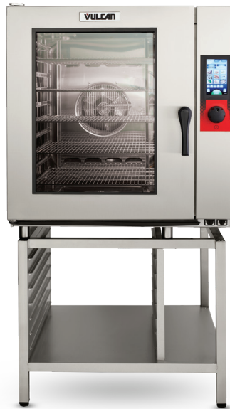
TCM102 shown on optional stand

Stainless steel racks with cutout design provides ease of access to pans, promoting kitchen safety.