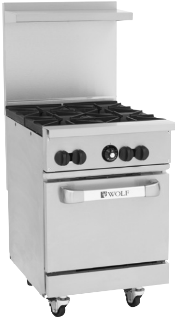
Model C24S-4B-N (shown with optional casters)