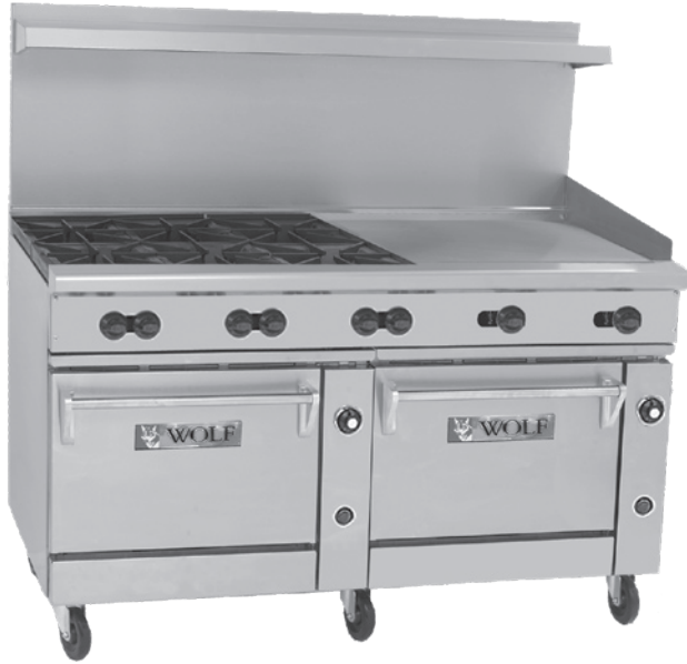
Model C60-SC-6B-24G-N (Shown with optional casters)