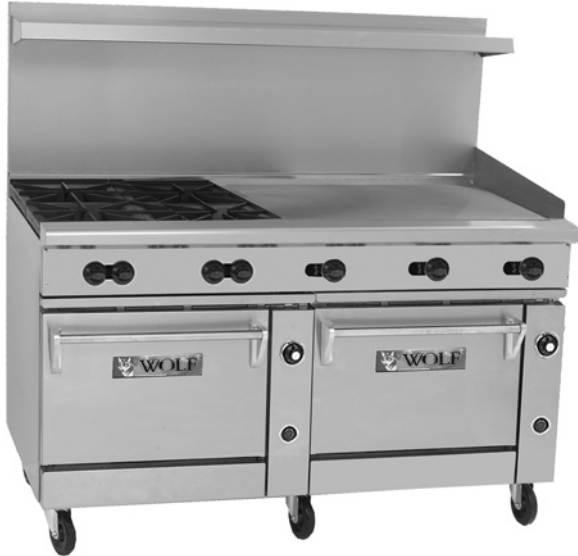
Model C60-SC-4B-36G-N (Shown with optional casters)