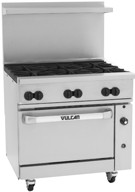
Model 36S-6B-N (shown with optional casters)