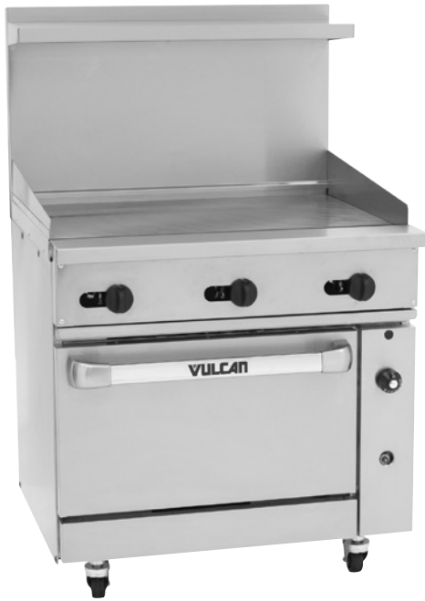
Model 36S-36G-N (shown with optional casters)