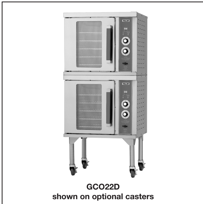
GCO22D shown on optional casters