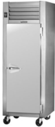
Model RHF132WP-FHS (shown with optional casters)