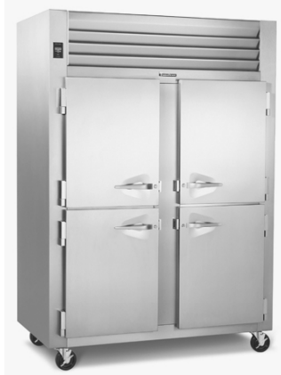
Model RHT232NPUT-HHS (shown with optional casters)