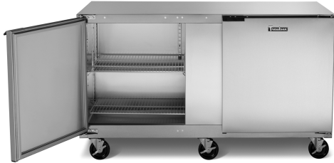
Model ULT48-LR (shown with optional casters)