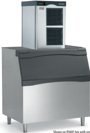
Shown on B948S bin with optional KLP8S legs.