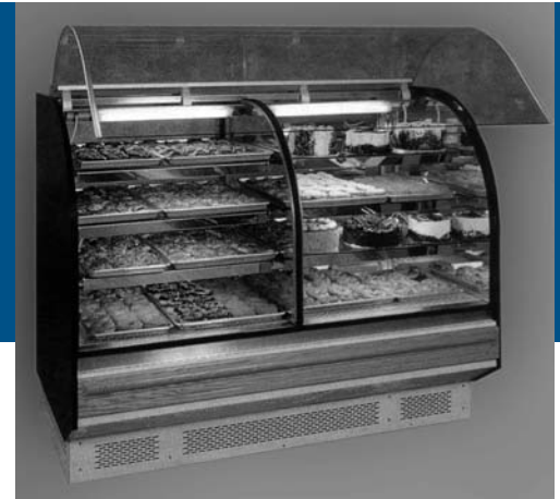
Half Refrigerated Self-Contained Half Non-Refrigerated

The SCXBRC is a metal framed half refrigerated and half non-refrigerated bakery display case with a choice of standard grade plastic laminate exterior ends and lift-up tempered curved front glass for easy cleaning and stocking.