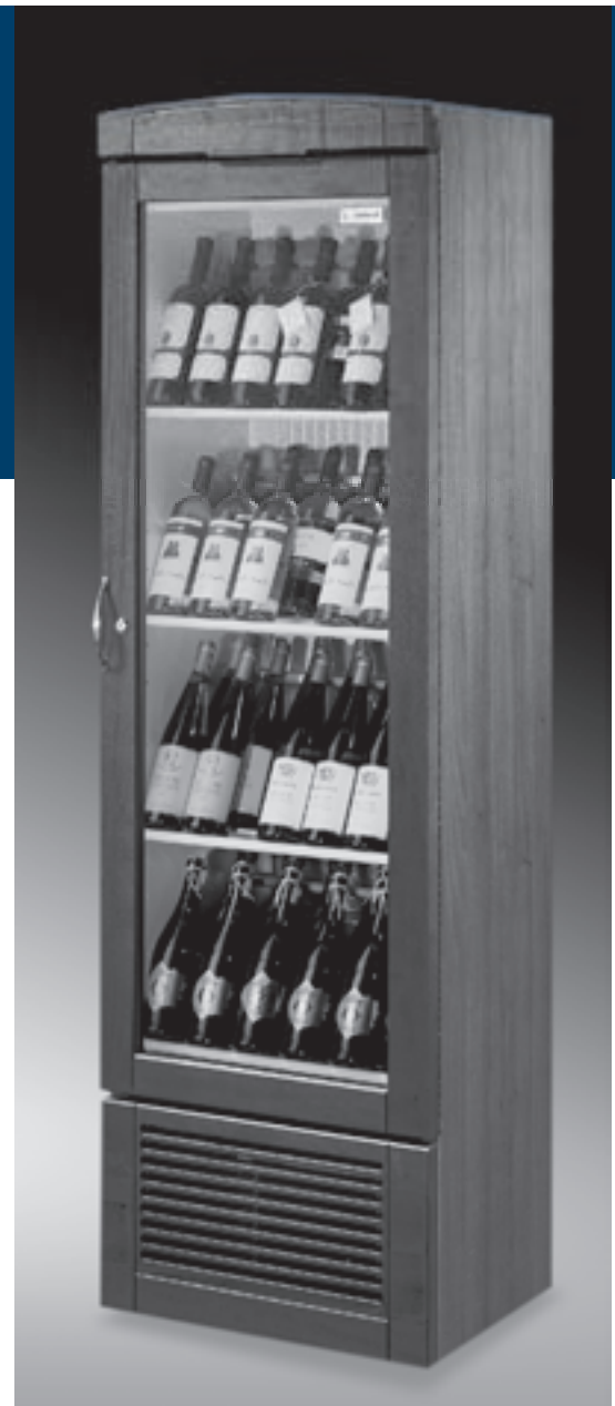
Shown with standard features.

Length: 24" x Depth: 20.5" x Height: 81"