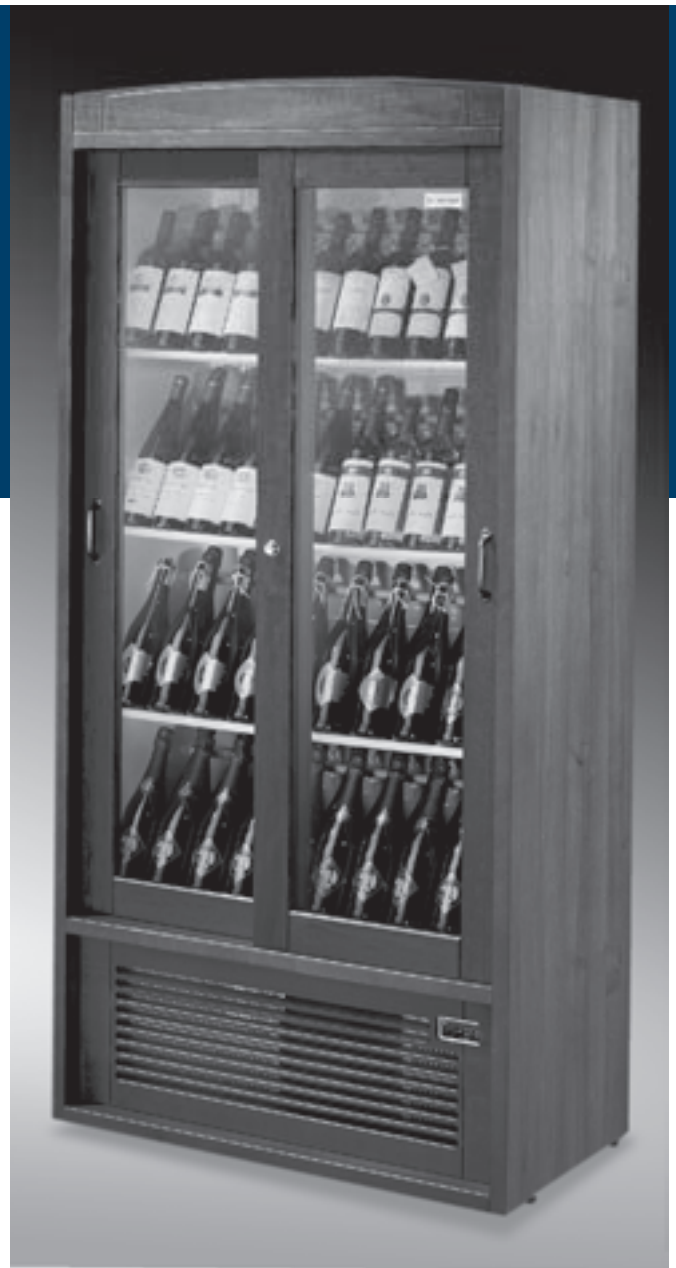
Shown with standard features.