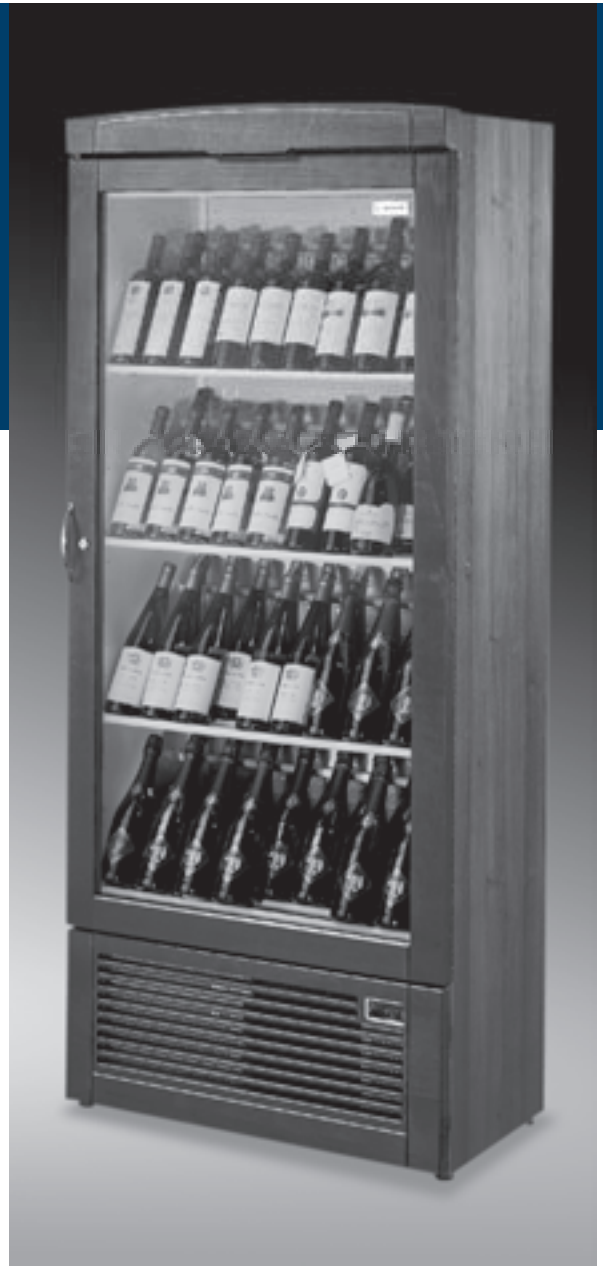
Shown with standard features.