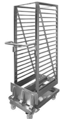
CE20HD shown with standard TTI-20H