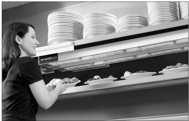
Model UGAH-42D with 3" (76mm) spacer. Remote control enclosure recommended (not shown)

CERAMIC HEATING ELEMENTS GUARANTEED AGAINST BURNOUT FOR ONE YEAR.