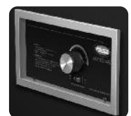
Standard Control for Auto-fill