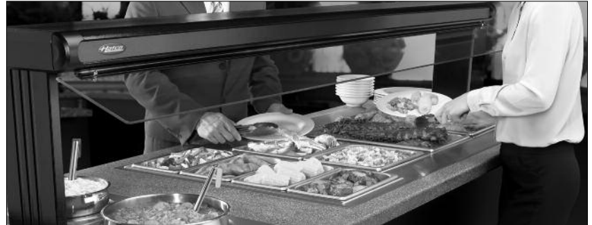
Model HWB-FULD with accessory food pan