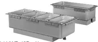
Model HWB-43D with accessory food pans (single unit holding 4 third-size pans)