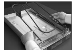
Quick access heating element and thermostat, for easy service