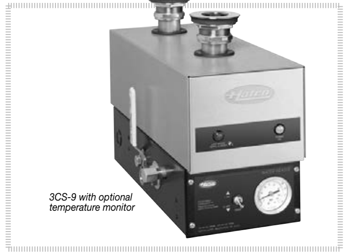
3CS-9 with optional temperature monitor