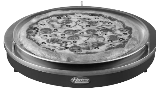
Model GRSR-19 with optional Designer color and accessory pizza pan