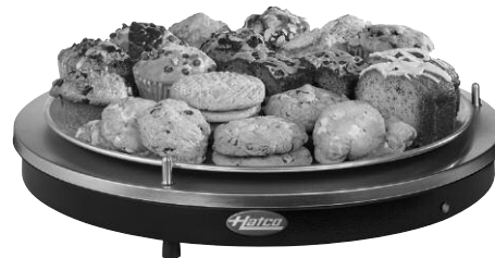
Model GRSR-17 with optional Designer color and accessory pan

BLANKET ELEMENTS GUARANTEED AGAINST BURNOUT AND BREAKAGE FOR ONE YEAR.