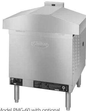
Model PMG-60 with optional Stainless Steel Body and Base and PMGH-60 Exhaust Hood