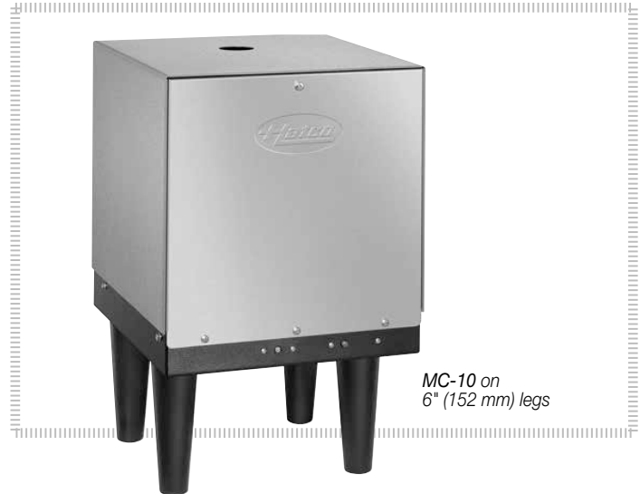
MC-10 on 6" (152 mm) legs