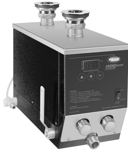
Model FR2-3 Patented