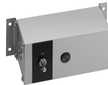
Model RMB-3F with toggle switch and indicator light