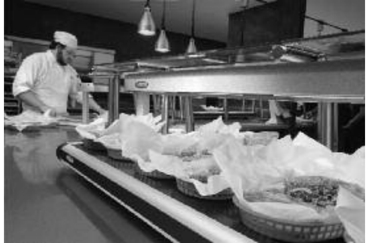
Model GRN4-48 in Stainless Steel over Glo-Ray® Portable Heated Shelf Model GR2S-42