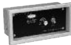
Remote Control Enclosure for Models GRN4-18 through GRN4-60