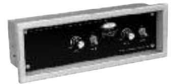
Remote Control Enclosure for Models GRN4-66 and GRN4-72