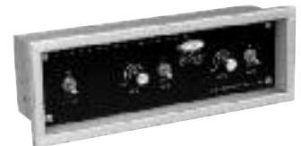
Remote Control Enclosure for Models GRN4L-66 and GRN4L-72