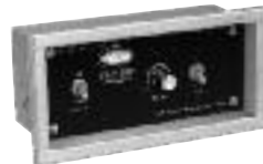
Remote Control Enclosure for Models GRN4L-24 through GRN4L-60