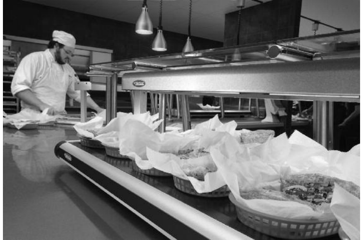
Model GRN4L-48 in Stainless Steel over Glo-Ray® Portable Heated Shelf Model GR2S-42

Model GRN4L-36 in Designer Black (Standard) alternates Halogen heat sources with Xenon light sources