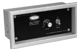
Remote Control Enclosure for Models GRN4-18 through GRN4-60