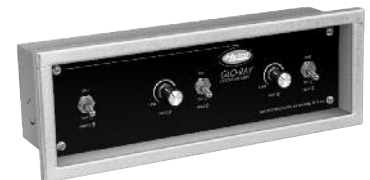
Remote Control Enclosure for Models GRN4L-66 and GRN4L-72