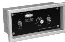
Remote Control Enclosure for Models GRN4L-24 through GRN4L-60