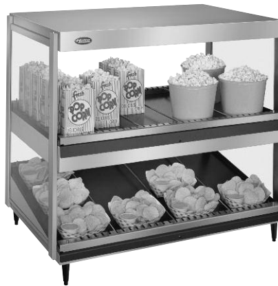
Model GRSDS/H-36D with slant base and horizontal top shelf and optional 15" (381 mm) clearance top shelf