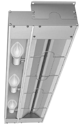
Model GRAML-36 with shatter-resistant incandescent lights, remote control enclosure (not pictured), and standard angle brackets