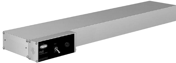
Model GRAM-18 with Control Enclosure with toggle switch and indicator light