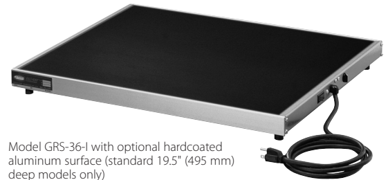
Model GRS-36-I with optional hardcoated aluminum surface (standard 19.5" (495 mm) deep models only)