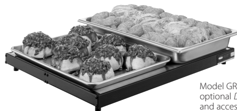
Model GRS-30-I with optional Designer color and accessory food pans