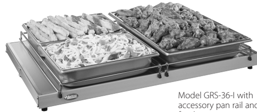
Model GRS-36-I with accessory pan rail and food pans