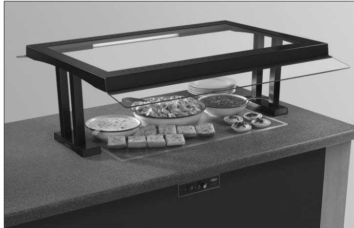
Model GR3L-41 with optional sneeze guards over GRSSB-3618 in Night Sky Decorative Stone