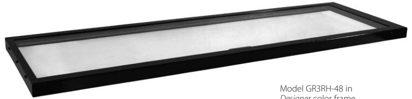
Model GR3RH-48 in Designer color frame

HEATED GLASS SHELVES ARE WARRANTED AGAINST BURNOUT FOR ONE YEAR.