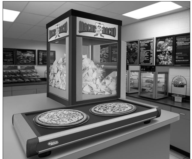
GR2S-36 with Designer color inset panels and accessory food pans