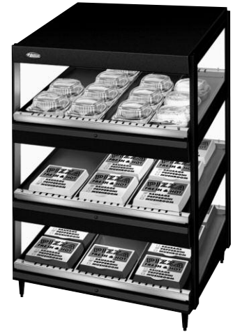
Model GRSDS-24T triple slant shelf in optional Designer black