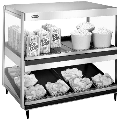
Model GRSDS/H-36D with slant base and horizontal top shelf and optional 15" (381 mm) clearance top shelf