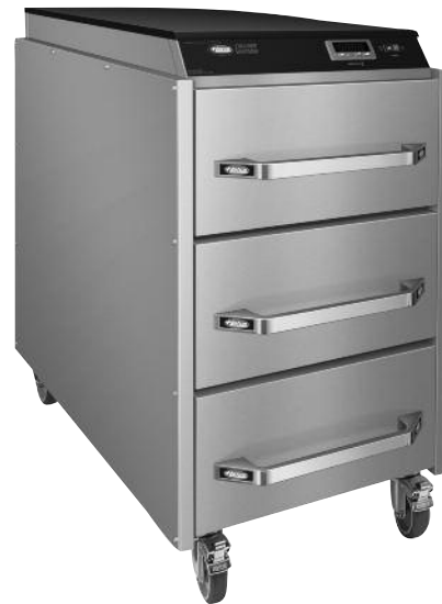
Model CDW-3N with low profile casters

METAL SHEATHED HEATING ELEMENTS GUARANTEED AGAINST BURNOUT AND BREAKAGE FOR TWO YEARS.