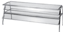
Deluxe Glass Display Shelf - 98x