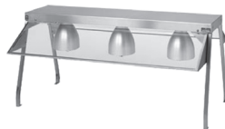
Deluxe Buffet Shelf - 83x/93x