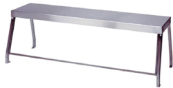
Deluxe Serving Shelf - 956-460-x