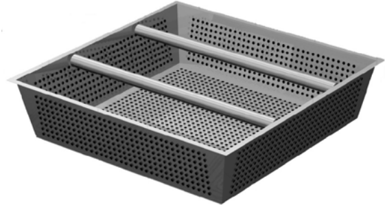
Perforated Basket - SK-57