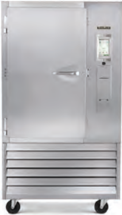
TBC13 13-pan reach-in model

At a glance, here's the best of what the Traulsen Blast Chiller with Epicon has to offer, all on one page.