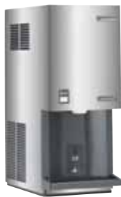
MDT3F12 / MDT4F12