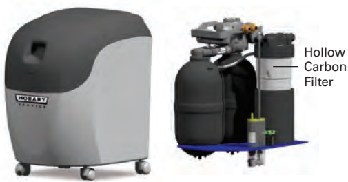
> WS-55 Series Water Softener, featuring the NSF-Certified Hollow Carbon Filter to reduce chloramines.

Although water utilities have used chloramines for almost 90 years, more municipalities are using them now partly due to new drinking-water regulations developed to limit certain disinfection byproducts. How often, and when, chloramines are used varies from one community to the next. There is no set schedule for their usage. So you can't predict when your combi could come under the attack of chloramines.