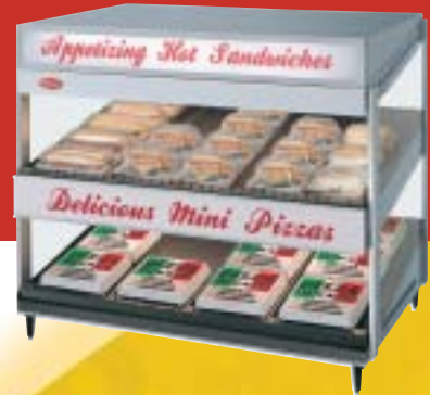
Glo-Ray model GRSDS-30D with optional backlit merchandising sign and accessory display sign holder (signs not included)