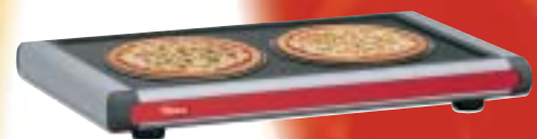
Glo-Ray model GR2S-30 with Designer color inset panels and accessory pizza pans