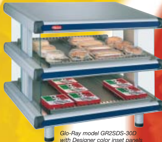
Glo-Ray model GR2SDS-30D with Designer color inset panels