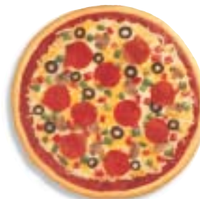
Even the whole pie.

The Hatco Glo-Ray® line offers several opportunities for pizza holding at waitress pick-up stations, kitchen work areas, self-serve and buffet lines, pass-through holding areas, and take-out and delivery facilities. From merchandisers to heated shelves, these countertop warmers feature infrared top heat, blanket element base heat or both, to ensure food safety. Choose from six Designer colors to compliment your foodservice environment.