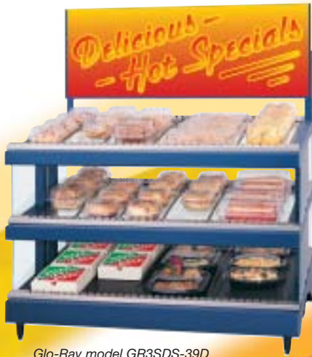
Glo-Ray model GR3SDS-39D with optional Designer color and accessory top sign holder (sign not included)