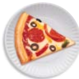
By the slice.

Increase your impulse sales—the Hatco Flav-R-Savor® and Flav-R-Fresh® Countertop Cabinets offer higher visibility of your product while balancing a precise combination of heat and humidity to extend pizza holding time. Available in a variety of Designer colors, these cabinets can be customized to match your décor. The tall Flav-R-Savor holds up to 16 boxed or eight bagged pizzas ready for delivery or take-out.