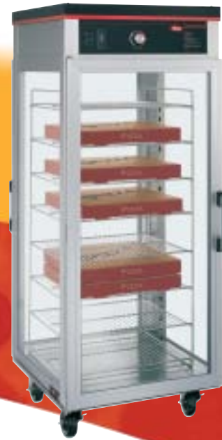
Flav-R-Savor model PFST-2X with 8-shelf multi-purpose rack and without humidity for boxed or bagged pizzas