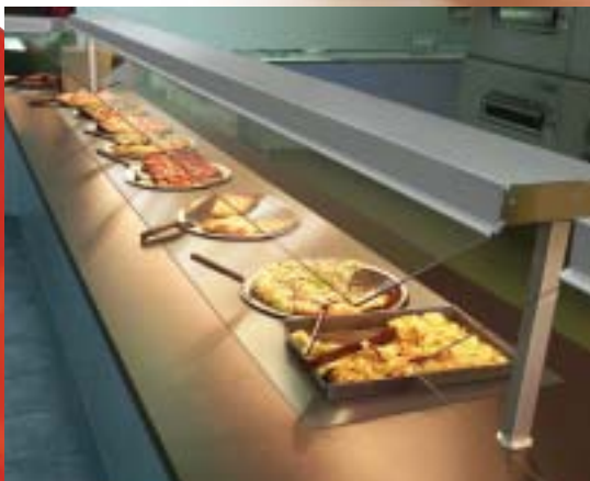
Glo-Ray model GRSBF-72-S drop-in heated shelf with flush top, optional stainless steel surface, and accessory pizza pans