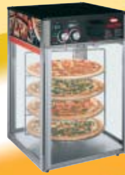
Flav-R-Fresh model FDW-1 with rotating 4-tier circle rack and accessory pizza pans and decals