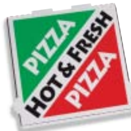
In the box.