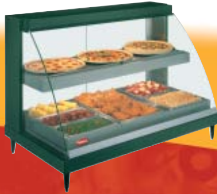
Glo-Ray model GRCDH-3PD with optional Designer color and accessory food pans