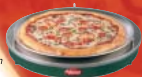
Model GRSR-19 with Designer color and accessory pizza pan