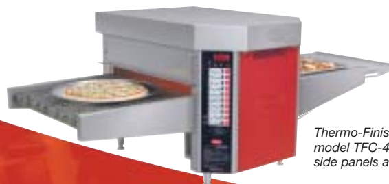
Thermo-Finisher™ conveyor food finisher model TFC-461R with Designer color side panels and accessory food pans