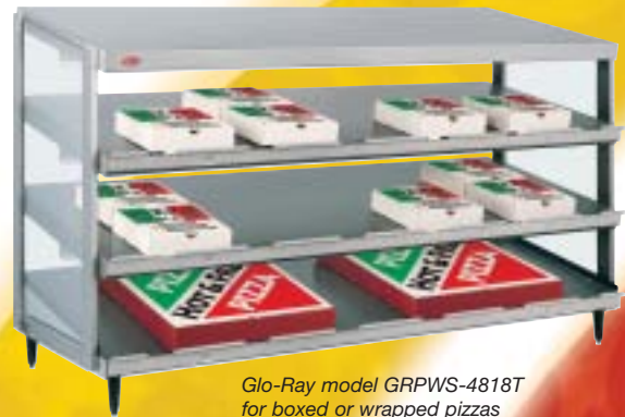
Glo-Ray model GRPWS-4818T for boxed or wrapped pizzas