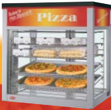
Flav-R-Savor model WFST-1X with 4-shelf multi-purpose rack and accessory sheet pans and decals