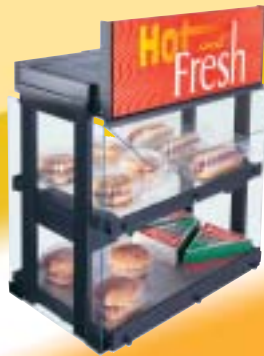
Glo-Ray model GRHW-1SGD with Designer color, breath protector, and accessory sign holder (sign not included)