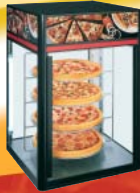
Flav-R-Savor model FSdT-2 with rotating 4-tier circle rack, optional Designer color, and accessory pizza pans and decals