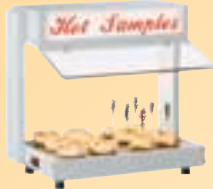
Model GRHW-.5P with blank translucent sign and backlit sign holder