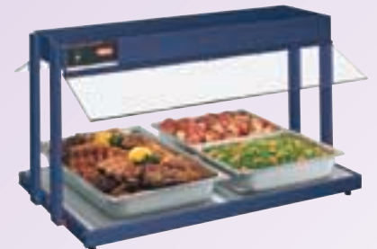
Model GRBW-30 with optional Designer color and accessory food pans