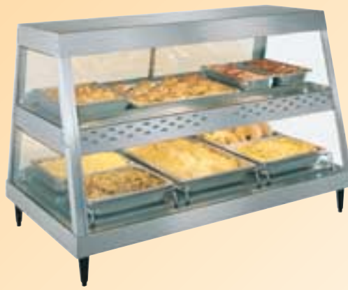
Model GRHD-3PD with optional mirrored glass doors and accessory food pans