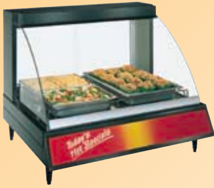
Model GRCD-2P with optional Designer color and backlit base sign holder (graphics not included) and accessory food pans