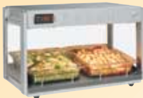
Model GRKW-1 with accessory pans