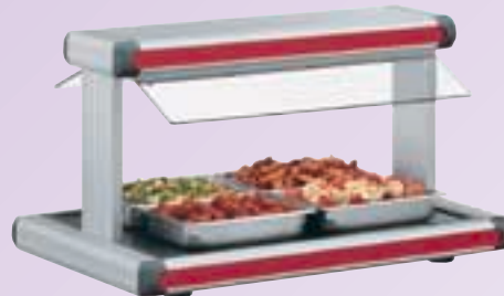
Model GR2BW-30 with Designer color inset panels and accessory food pans