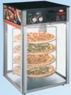
Model FDW-1 with accessory pizza pans and decals