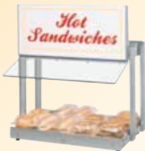
Model GRHW-1SG with hardcoat bins and sign holder (sign not included)