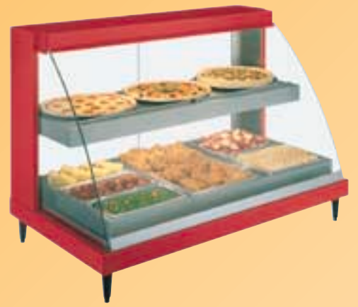
Humidified model GRCDH-3PD with optional Designer color and accessory food pans