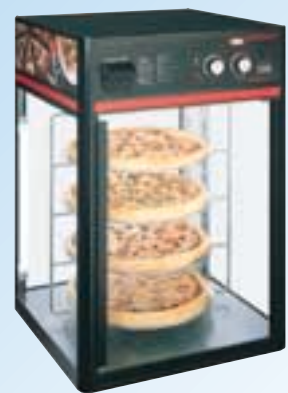
Model FSdT-1 with accessory pizza pans and decals