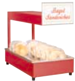
Model GRFFL with optional Designer color and sign holder (sign not included)