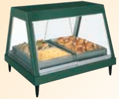
Humidified model GRHDH-2P with optional Designer color, double-side opening and accessory food pans